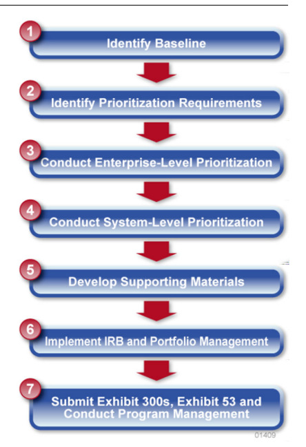
FIGURE 1 Integrating IT Security and Capital Planning

7. Submit Exhibit 300s, Exhibit 53, and Conduct Program Management: ensure approved 300s become part of the agency's Exhibit 53; ensure investments are managed through their life cycle (using Earned Value Management for Development/Modernization/ Enhancement investments and operational assessments for steady state investments) and through the General Accounting Office (GAO) Information Technology Investment Management (ITIM) maturity framework.